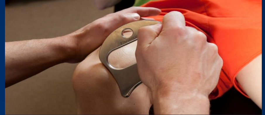
Manual Therapy Tools